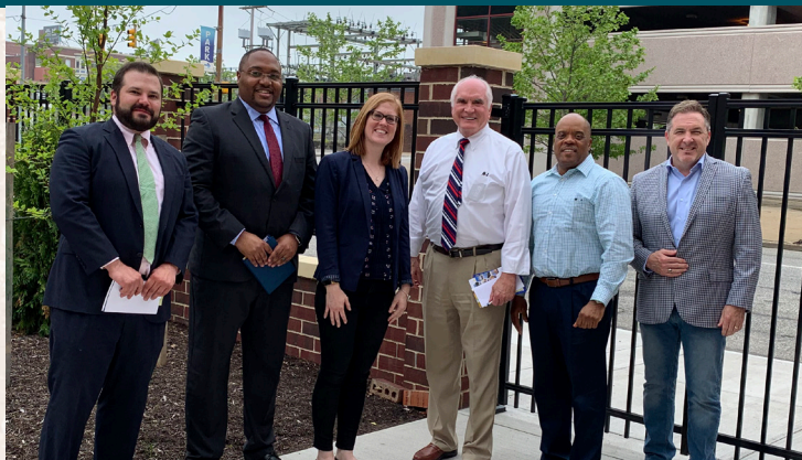
The Erie City Mission was honored to host Representative Mike Kelly and his staff for lunch and a tour of the newly finished campus.

It's summertime at the Mission--a busy time of the year for sure with added sunlight and better temperatures that add to the hope-filled atmosphere on the corner of French & 11th.