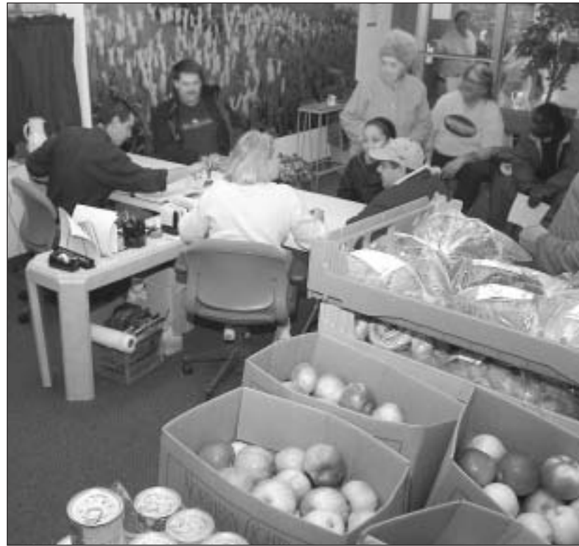
A bright, more cheerful atmosphere awaits clients, staff and volunteers at the new Family Care Center on French Street.

A staff member or volunteer assists each client with item selection, based on need and preference. Bags were pre-packed