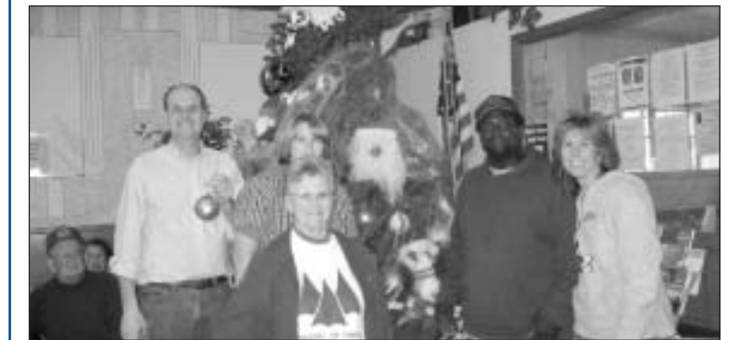
Volunteers deliver the giant "Giving Tree," donated by Green Prosthetics & Orthotics to the Mission's dining room. The 10-foot tree, the centerpiece of the Festival of Trees, came with scarves, hats, and toiletries for men at the Mission. It was decorated by Rose Floral Shop.

Proceeds from the campaigns, like other gifts, are used to provide services to the poor.