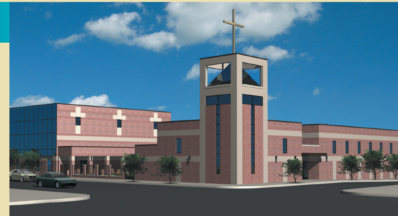
Artist's Rendering of Completed ECM Campus 11th & French Streets, Erie, PA